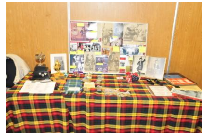
A display of BCHDA awards

In the event of a tie, the tie breaking procedure might be used to determine the aggregate winner. This is always used in the event of a tie at a championship.