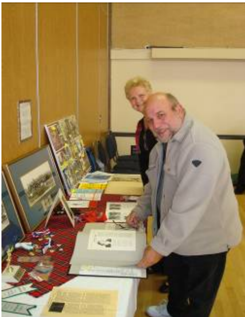
Dancing memorabilia table