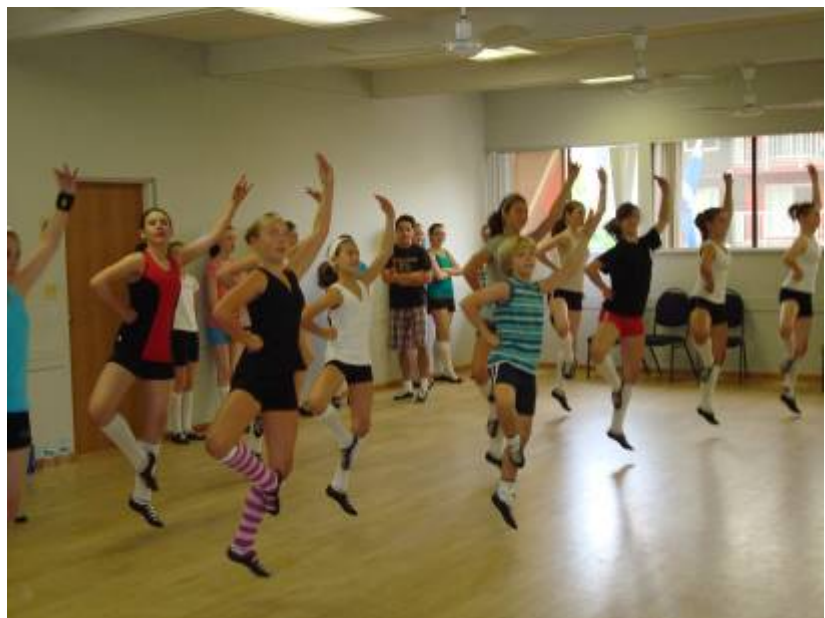
Participants working hard at the dance seminar. 37 attended