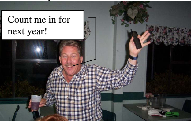
Count me in for next year!

Golly how many balls am I going to lose today?